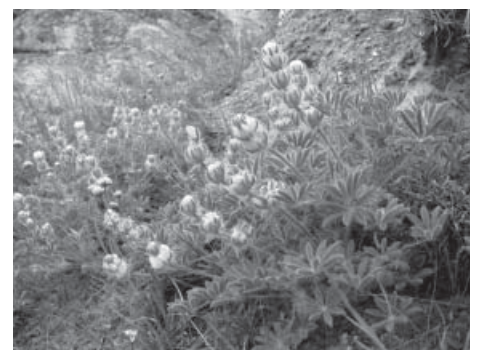
Dense-Flowered Lupine: An endangered plant species

working along with the Department of National Defence on strategies to protect these unique plant species.