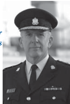
Chief Constable Graham