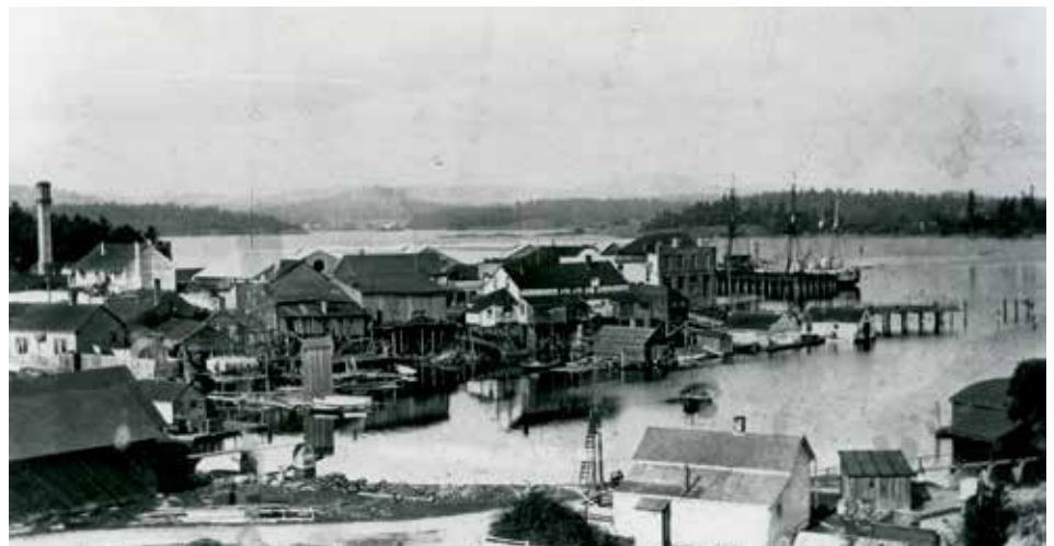
Pioneer Street in Esquimalt Village, now within CFB Esquimalt boundary [ca. 1912]