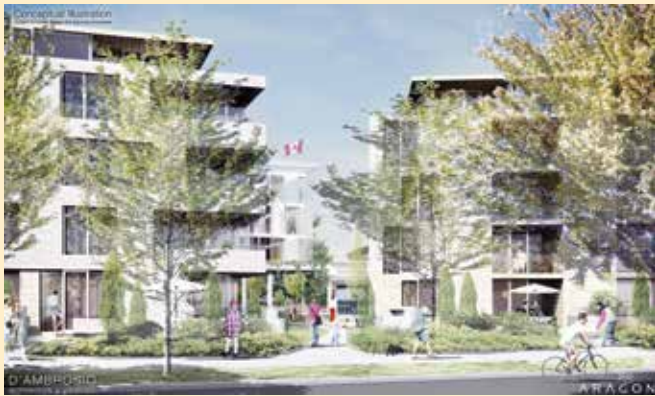
Artist rendering of through block art walk viewed from Carlisle St. Building "A" on the left.