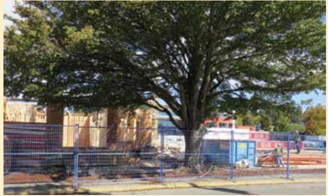
September 2018 photo of Building "A" construction and art walk to its right.

The Esquimalt Town Square project is taking shape, with the south buildings on the property along Carlisle Street rising above ground. The property has been branded with the tagline "Together is Everything," drawing attention to the community focus of the project, which will include an art walk, public square, new library, office and retail space, and market and rental housing. Housing will include 68 market units and 34 rental units. Leasable office space will comprise 37,000 square feet and commercial space will encompass over 4,300 square feet.