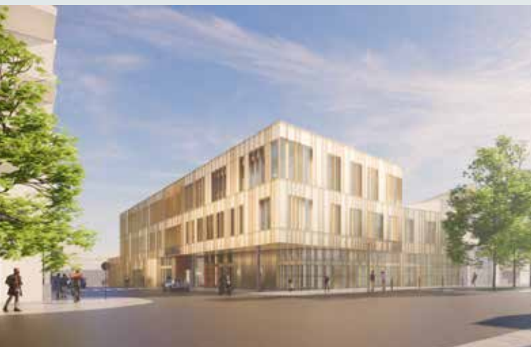
View from the corner of Esquimalt Road and Park Place

Full details about the process, building information to date and the rezoning process are at esquimalt.ca/PublicSafety .