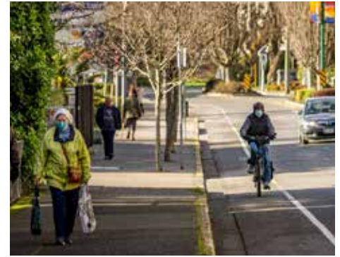
We're looking for your ideas on making Esquimalt a more attractive place to walk, roll and cycle.

The made-in-Esquimalt plan will be inclusive, visionary and driven by best practices and the latest design guides to reflect the needs, interests & priorities of the community.