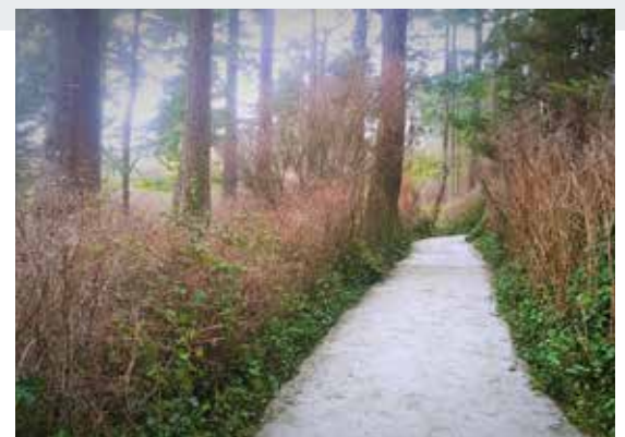
Trail improvements at Saxe Point Park

The main loop trail, big leaf maple trail and washroom access trails will be walkable year-round now that we have added drainage in some key areas along with the permeable gravel. A new information and educational kiosk complete with a trail map will be installed near the main parking lot as well, thanks to a grant from Seaspan.