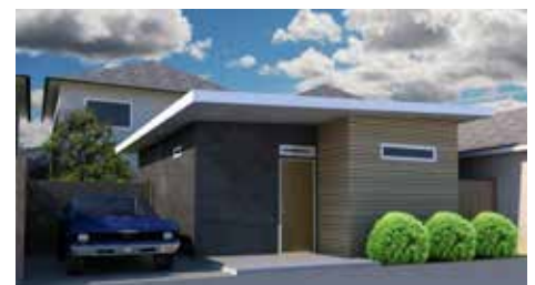
Example of a detached home.

For more information on what is being proposed and which properties are considered eligible, please check out Esquimalt.ca/housing