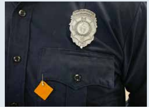
Esquimalt firefighter displaying the Moose Hide pin