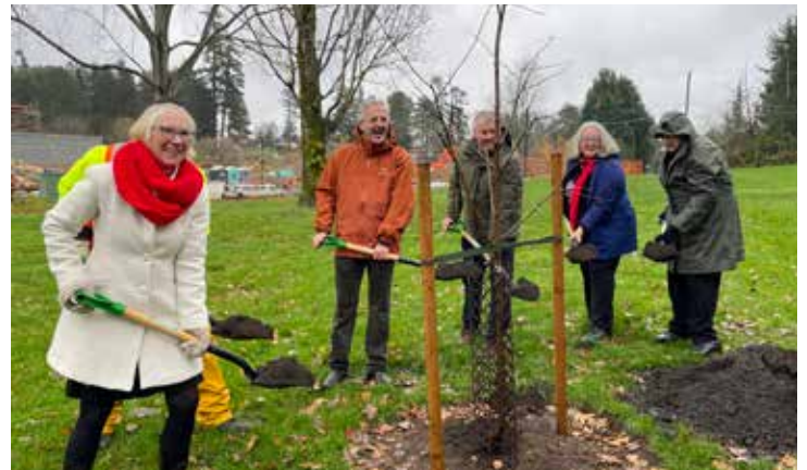
For 100 years, the Victoria Horticultural Society has supported gardeners and gardens in our communities. Congratulations on a history of knowledge and skill! This planting and bench unveiling was November 18.

The Township of Esquimalt in partnership with World Fisheries Trust and the Gorge Waterway Action Society will be receiving a grant from the Pacific Salmon Foundation and the Stewardship Centre of BC to develop a "green shore" at Esquimalt Gorge Park estuary.