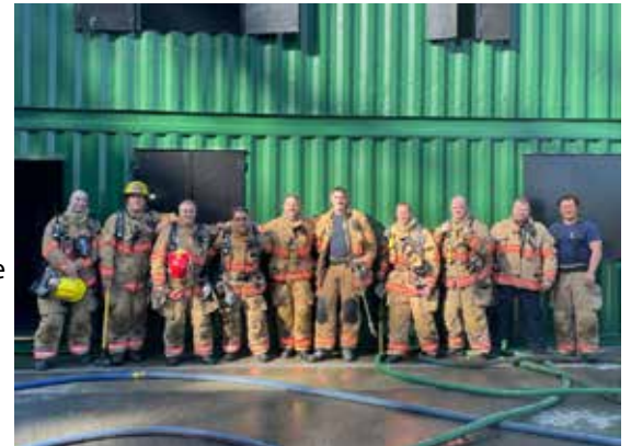
A Platoon after a live-fire training session.

The Esquimalt Fire Department is developing a dynamic strategic plan to guide the fire department over the next five years. This plan will guide the delivery of valued, cost-effective and efficient protective services to the citizens and businesses of the Township of Esquimalt, community partners and other stakeholders.