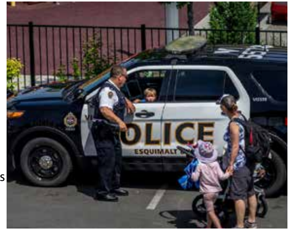
VicPD at the 2019 Neighbourhood Party.

The 2014 Police Framework Agreement is set up for renewal in 2024. The agreement is intended to clarify many aspects of service delivery and governance including sharing of costs of the amalgamated police force, dedicated resources for Esquimalt and City of Victoria, budget approval processes, dispute resolution and performance metrics. The Township needs to decide whether or not to renew the agreement for another ten years within the dates of July 1 and December 31 2022.