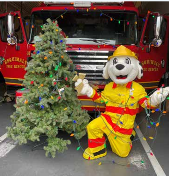
Sparky the Fire Dog practices safety when it comes to holiday decorating.

Dry trees are a very real fire danger. Do not leave them lying against your home or garage.