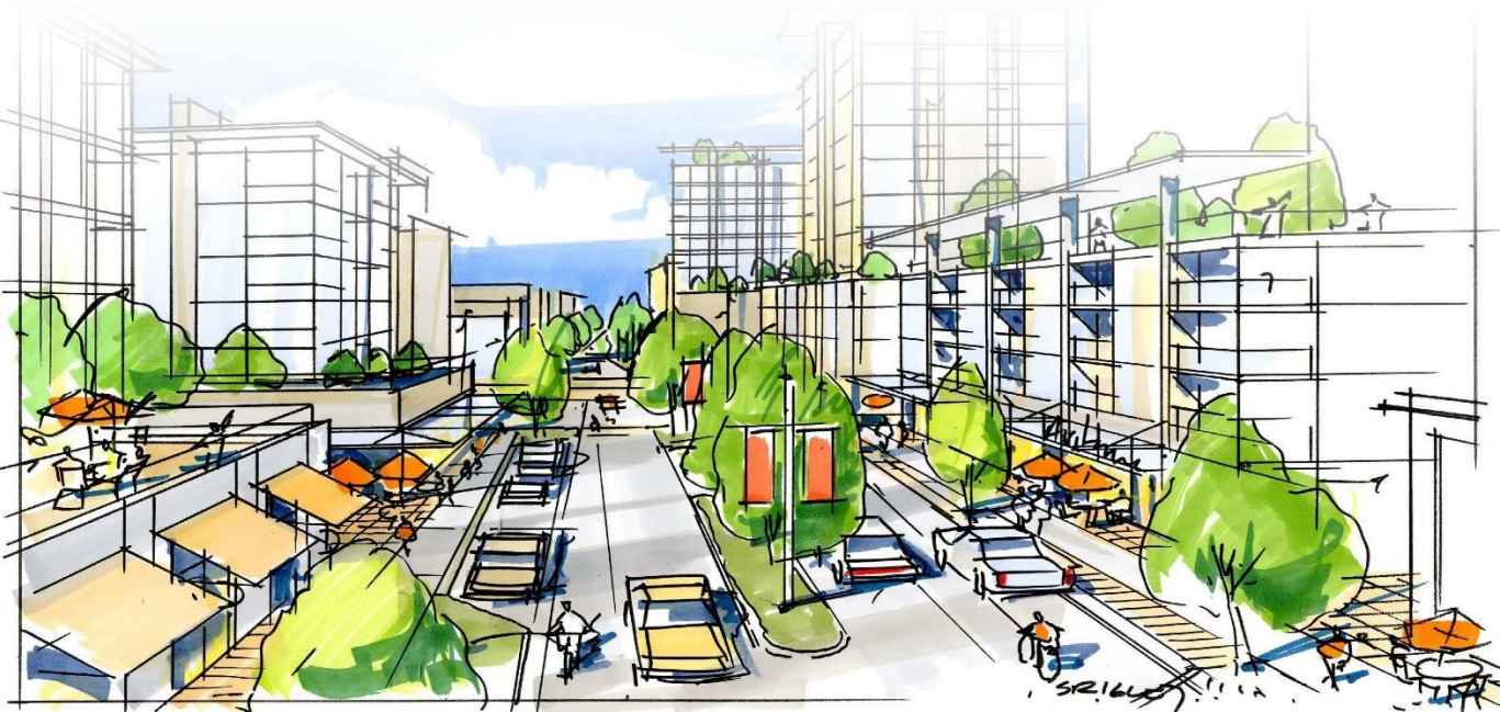
Sketch by Calum Srigley – Design Consulting