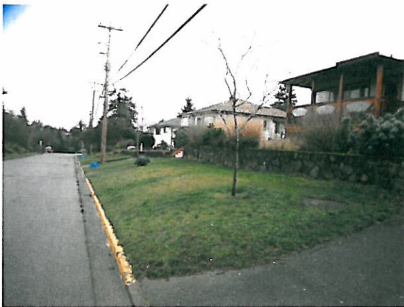
Figure 1 - Boulevard with no sidewalk

Between the two borders, the remaining components of the boulevard can be laid out in several arrangements which may or may not include all the components. Examples of the standard are highlighted in the following pictures.