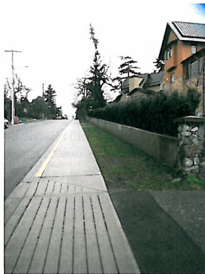
Figure 2 - Boulevard with adjoining sidewalk