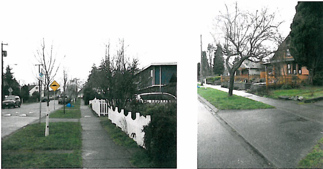
Figure 3 - Boulevard with separated sidewalk

In the pictures it can be seen that various surface infrastructure are located within the boulevard such as: