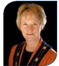
Mayor Barb Desjardins