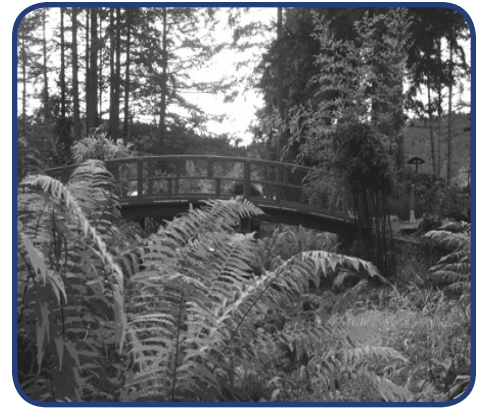
Takata Japanese Gardens, Glendale Gardens, Saanich