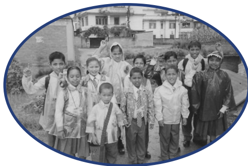
Children at Save Child Blessing Home Orphanage, Nepal

Nepal, a small country located in the Himalayan Mountains between India and China (Tibet) is one of the poorest and least