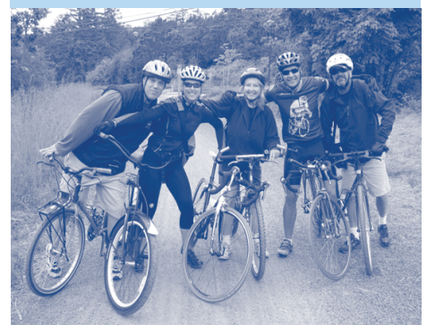
Staff during 2008 Bike to Work Week

The BCRPA grant will help encourage cycling to Esquimalt parks and facilities.