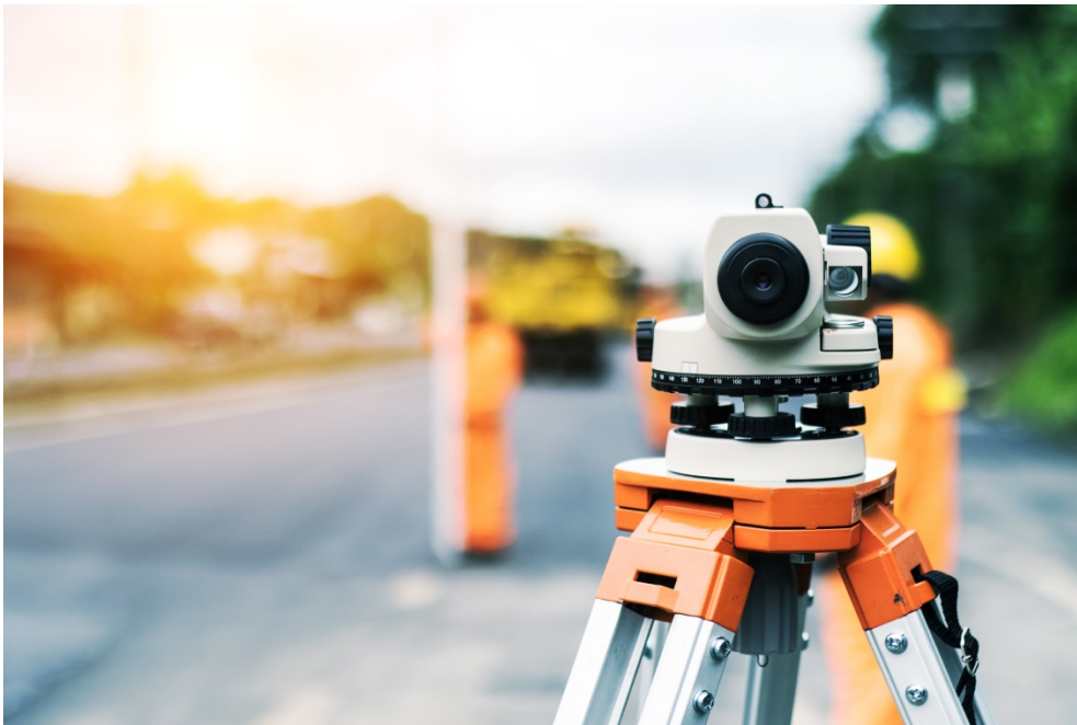
Local services and infrastructure objective: “Develop an Active Transportation Plan.”