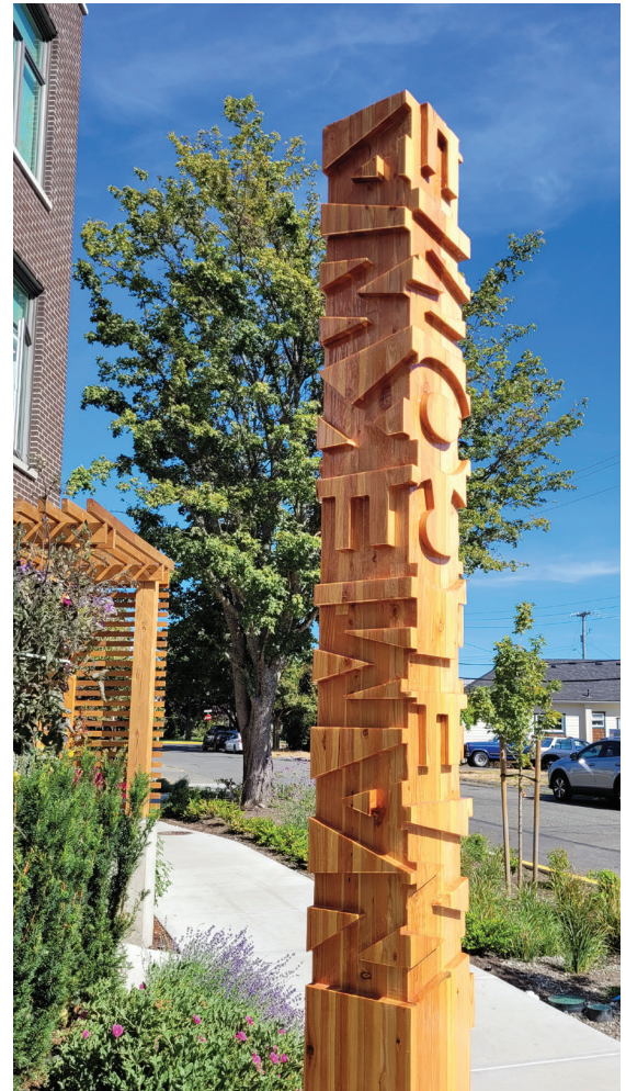
"Welcome" pole at Esquimalt Town Square

Net proceeds raised by the Esquimalt Ribfest are returned to the community through the Esquimalt Firefighters Charitable Foundation and the Esquimalt Ribfest Society. Funds go to local charities and school-sponsored activities for our community's youth. More at www.EsquimaltRibfest.com