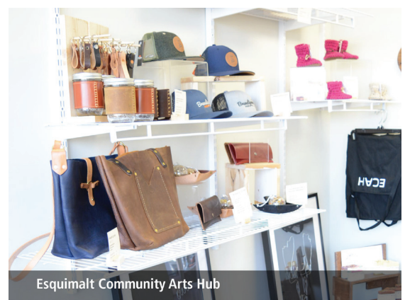
Esquimalt Community Arts Hub