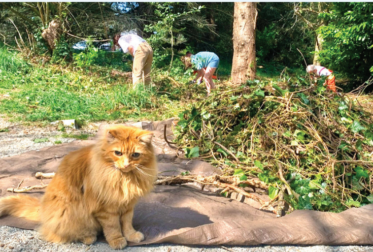
Volunteers remove invasive plants from Esquimalt parks under careful supervision.

If you can't make this event, sign up for a volunteer orientation session in our parks and join us another time. More at www.esquimalt.ca/branchoutvolunteer