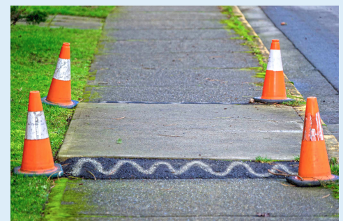
Trip hazards are on the list of summer repairs