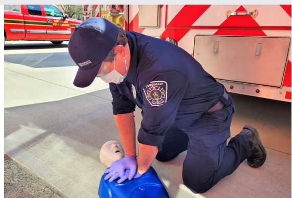
Try CPR at home with one of our first aid mannequins

Registrants will book a dedicated time to receive a CPR mannequin and live training session from an Esquimalt Fire Department member. More information about registration at esquimalt.ca/CPR