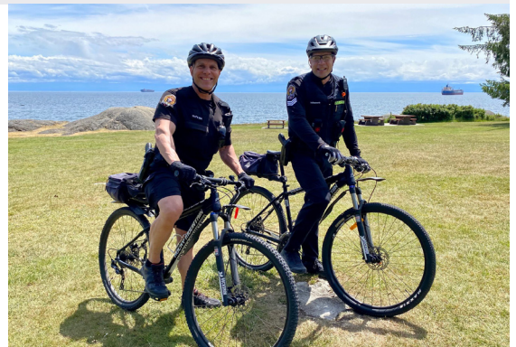
VicPD officers will be out on foot and bike in Esquimalt.

You may see them on foot or bike in the day, evenings and weekends. Please say hello!