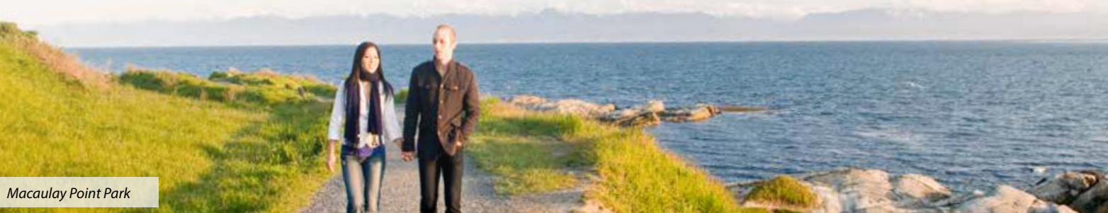
Macaulay Point Park

Staff reports and project information can be found at esquimalt.ca/PublicSafety