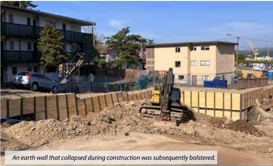
An earth wall that collapsed during construction was subsequently bolstered.