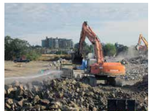
Construction work through the fall and winter 2017/2018 will include site preparation and concrete pouring at McLoughlin Point and geotechnical work on the conveyance system between the future plant and Hartland Landfill, where residual solids will be processed.

Information and photograph courtesy of the Capital Regional District. For more information, visit www.wastewaterproject.ca