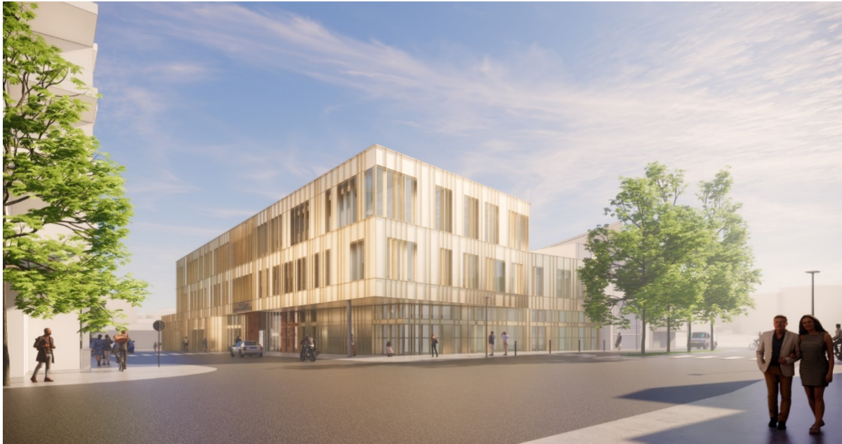
Architectural illustration of proposed design