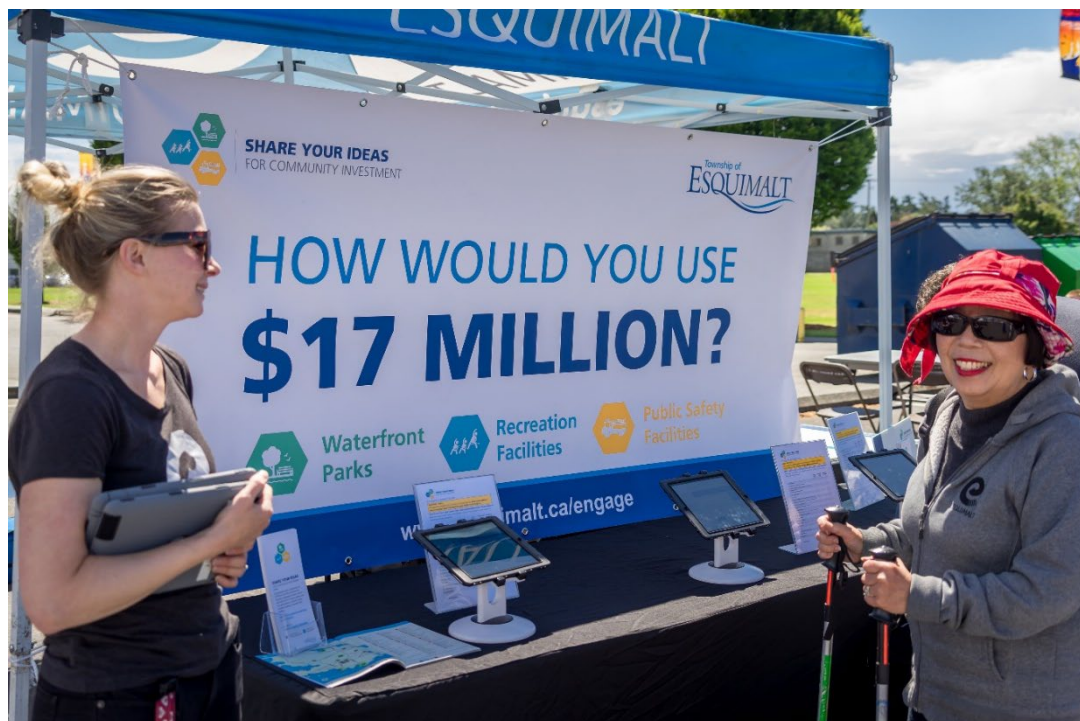
2018's public engagement included going to community events.