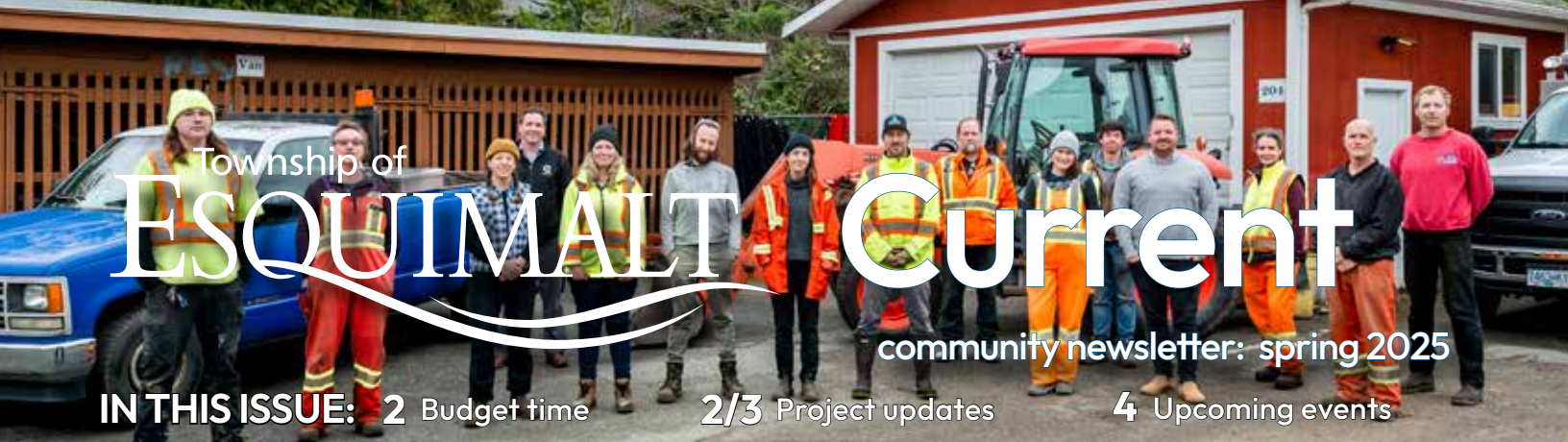
Esquimalt Parks team