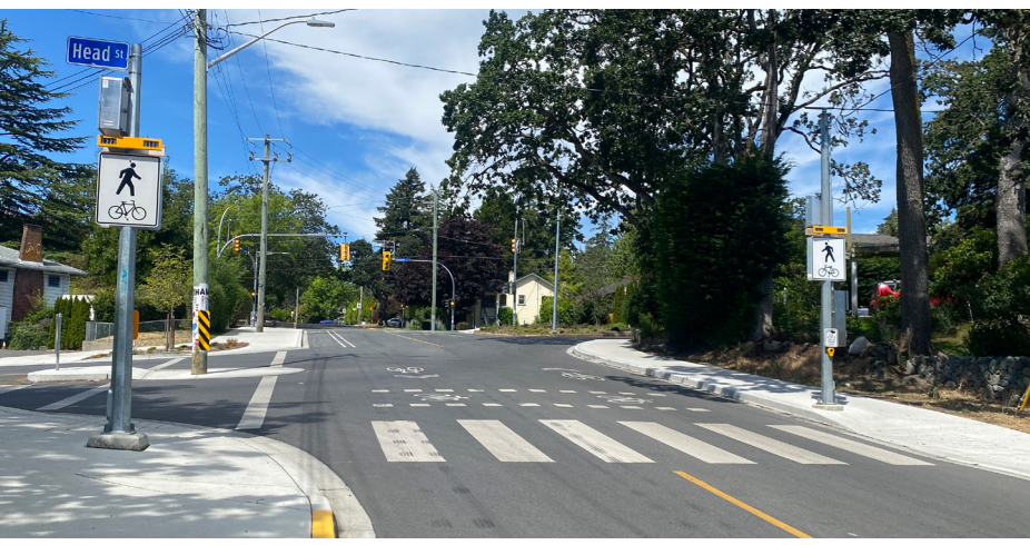
The Tillcum & Lampson corridor project featured new sidewalks, improved pedestrian crossings and protected bike lanes to create a safer active transportation network through Esquimalt.

counter. Open the QR code or go to esquimalt.ca/ActiveTransportation to find the link.