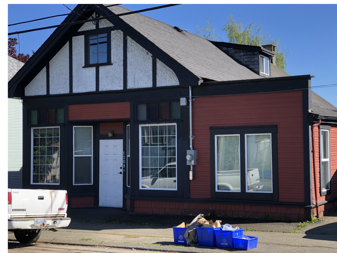
EXISTING STREET VIEW