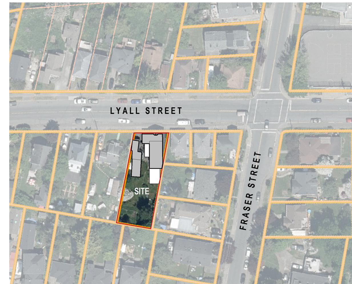
CONTEXT PLAN 0m 20m 40m 60m 80m 100m SCALE 1:1000

CIVIC ADDRESS: 1209 LYALL STREET LEGAL ADDRESS: LOT 5, SECTION 11, EQUIMALT DISTRICT, PLAN 946 PID 004-774-701 EXISTING OCP LAND USE DESIGNATION: LOW DENSITY RESIDENTIAL EXISTING ZONING: RS-6 SINGLE FAMILY DADU RESIDENTIAL ZONING AMENDMENT: BYLAW NO. 3082 ADD MICRO BEVERAGE MANUFACTURE TO PERMITTED USES PROPOSED REZONING: TO PERMIT COMMERCIAL (BREWERY TASTING ROOM) SITE AREA: 707m 2 RESIDENTIAL AREA: 171m 2 (2 LEVELS + GARAGE) BREWERY AREA: 64m 2 (TASTING ROOM + NANO BREWERY) FLOOR AREA RATIO: PERMITTED = MAX. 0.35 PROPOSED = 0.33